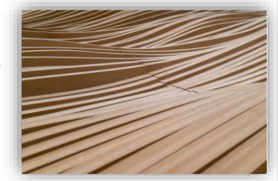
3D printing of wood