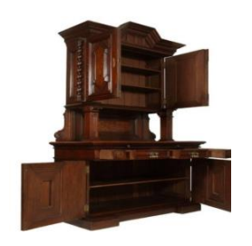
Figure 2. Presentation of the two drawing copy tasks. The basic task 1 (the shelf) and the complex task 2 (the buffet) are copied using Time2sketch software in a virtual environment.