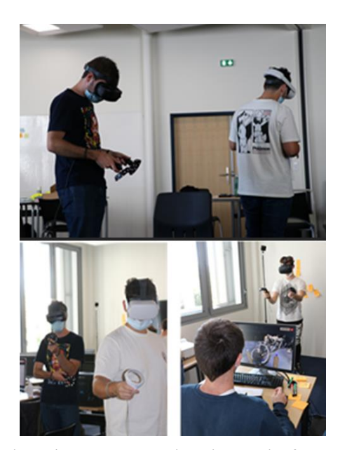
Figure 4. Users collaborating with the Time2sketch software.

Some limitations and perspectives appear with this study: firstly, we used students for the field experiment, which is not representative of a target population, even if it is close. For example, this excludes criteria such as the diversity of profiles related to age. Secondly, to the best of our knowledge, there are no scoring criteria for evaluating drawings in virtual reality. We therefore suggest our own criteria which would deserve to be evaluated on several studies with several judges. Thirdly, other types of 3D virtual reality drawing exist (e.g., Hyve-3D). The Hyve-3D [27] would allow to realize cleaner drawings but would have a longer learning process. It would be interesting to know which tools would be the most suitable for this kind of project with novice users.